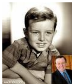
And Jerry Mathers As The Beaver