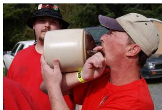
The First Tast of Apple Pie

Well another candle lite has come and gone. It was a bitter sweat gathering the mural was kind of low knowing that it this was the last doins at brother Buzzards home on the Island. The sweat part at least for the grey beards is that we