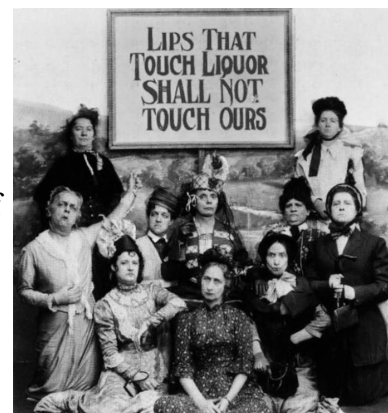
From a 1919 poster from a Montana history book

Loggers Jubilee, Edmonds 4 th of July, Wilkeson Days, Snoqualmie Railroad Days, and Black Diamond Labor Day. I hope to see lots of redshirts again at each of these events, so come along and have some fun.