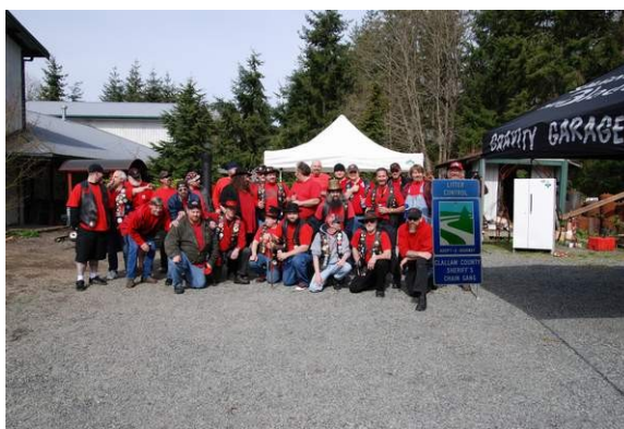
Clallam County Sheriff's Chain Gang